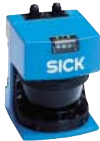
LMS Indoor Laser Measurement System