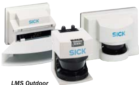
LMS Outdoor Laser Measurement System

SICK is one of the world's leading producers of sensor systems for industrial use. SICK is a technology and market leader in both factory and process automation. The company, founded in 1946 and based in Waldkirch, Germany, is represented worldwide by numerous subsidiaries, participations and sales agents.