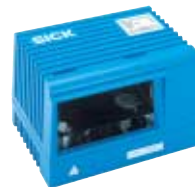
LMS 400 for automation applications