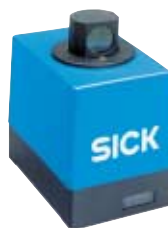
NAV 200 Positioning system for automated guided vehicles