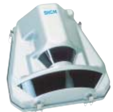
LD PeCo People Counter